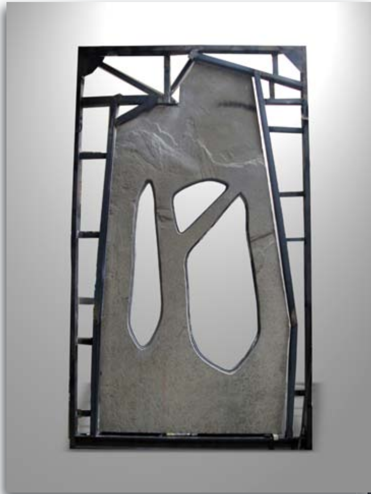
The STONE DOOR