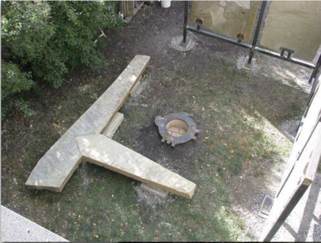
Bench Joint Detail